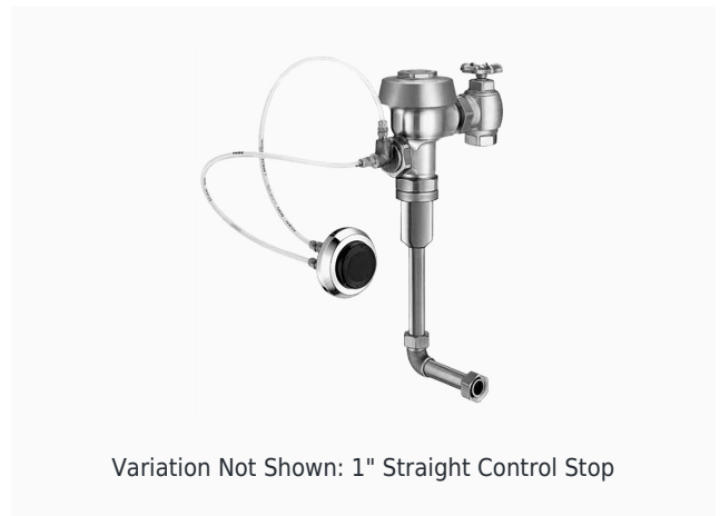
Variation Not Shown: 1" Straight Control Stop